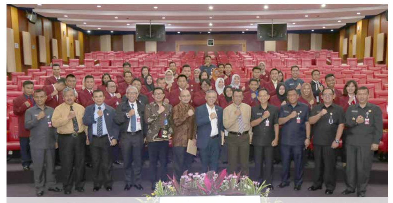
IDU held Strategic Defense Seminar and Result of National Field Study Seminar

Defense strategic Faculty of Indonesia Defense University held the strategic defense seminar entitled "Strategy in Facing Radicalism through Cyber Space" at Auditorium of IDU, IPSC Sentul-Bogor, Tuesday, 15th February.