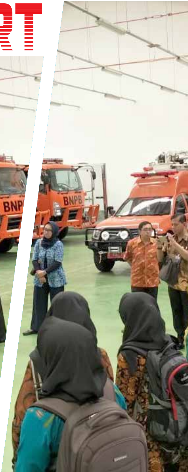
IDU Students Study Visit To Disaster management education and training center of National Disaster Management Agency's