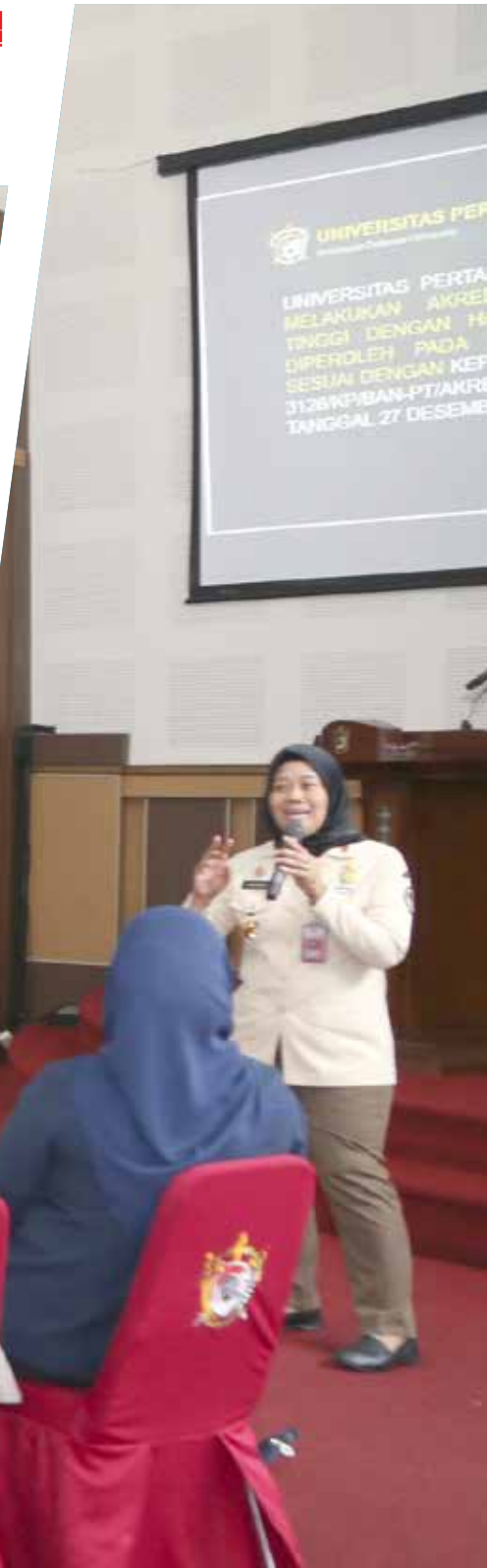
IDU Gathered with the Mass Media Crew